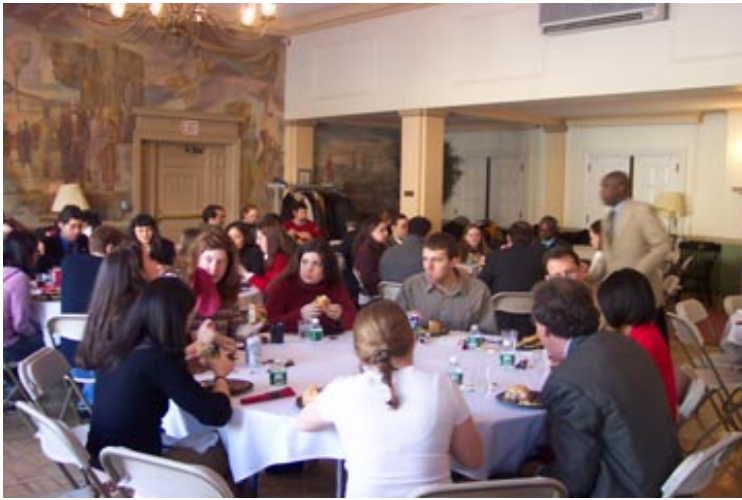
2004 Fulbright American Studies State Department Institute on U.S. National Security lunch