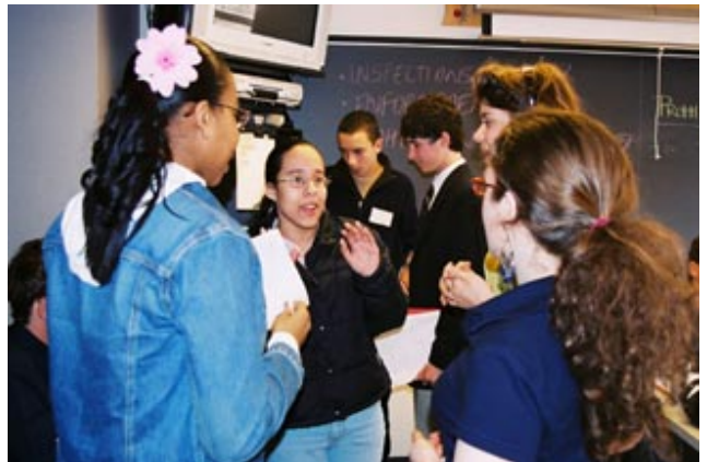
Students deliberating the US role in the Middle East

• The entire EPIIC class and 14 students enrolled in the Inquiry Teaching Group (total of 61 Tufts students) mentored the high school students from October through April in preparation for the April role-playing simulation on "The Role of the US in the Middle East."