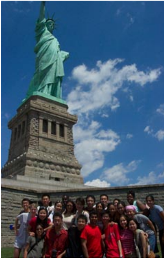
TILIP 2003-04 at the Statue of Liberty

• Despite the challenge of SARS, which withered many US-China exchange programs, TILIP successfully held its sixth year, switching the summer program to the US (New York City and Washington, DC) and the winter program to China (Hong Kong and Beijing). This effort was acknowledged in “Studies of China Adapt to SARS,” in the New York Times on August 10, 2003.