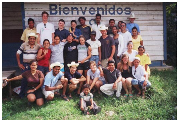
TIILES in Nicaragua

• While the preponderance of research engages undergraduates, support for graduates is not unusual, e.g. a Fletcher & Engineering graduate student was supported in his research on water and climate change in Israel and the West Bank.