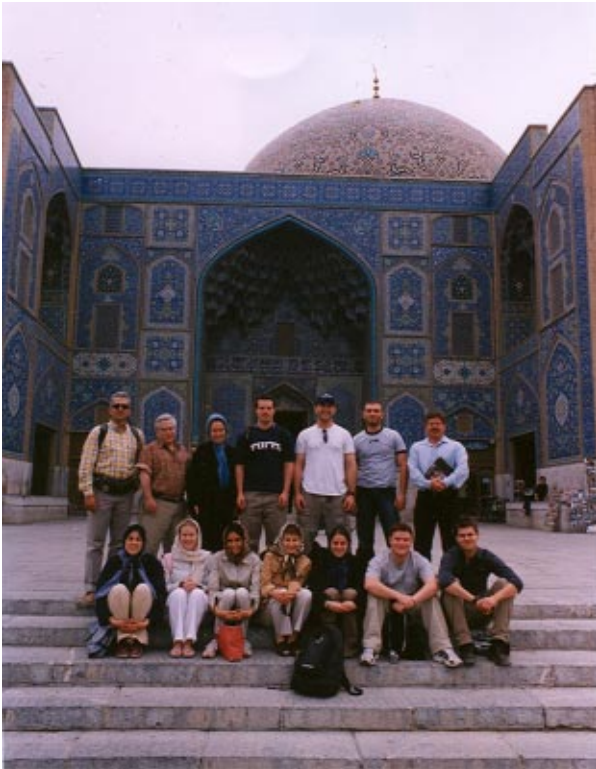
The members of the Tufts Iranian Dialogue Initiative at the Sheikh Lotfollah Mosque in Isfahan, Iran