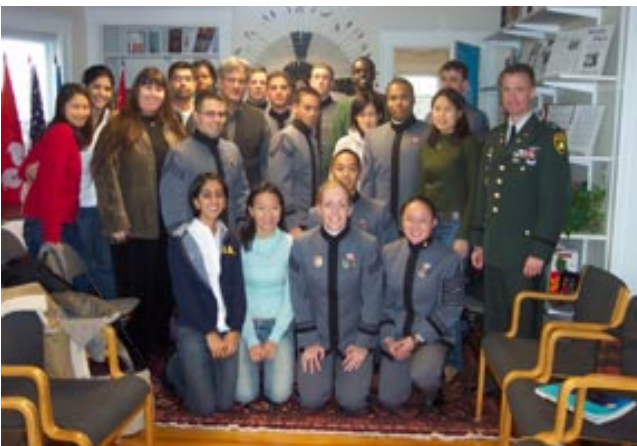
USMA cadets and TILIP

• In the fall, ten cadets interacted with the TILIP students and scholars, security analysts, and journalists over a two-day period on China’s foreign policy, including a video conference exchange with Beijing and Hong Kong students.