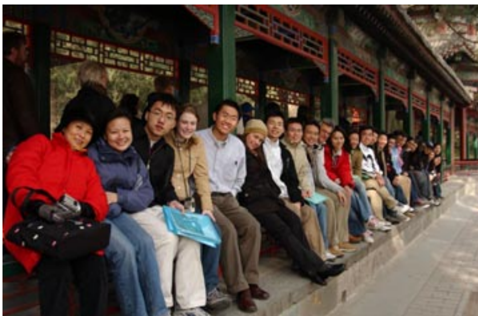
TILIP 2003-04 in Beijing

• The TILIP symposium was held over spring break to coincide with President Bacow’s trip to China in an effort to maximize fund raising; unfortunately, President Bacow was unable to participate on the China trip due to illness.