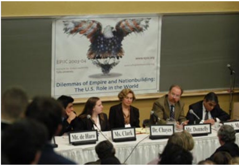
U.S. Empire: Pax or Pox Americana? panel at the EPIIC symposium

of the UN; an analysis of the Haitian intervention by President Clinton's special envoy; a debate on the US as empire between three United Nations Ambassadors and one of the authors of the President's National Security doctrine; the future role of the US military; US engagement in Africa and Asia; and historical perspectives on US nation building and intervention, from Bosnia to Somalia, from Afghanistan to Iraq.