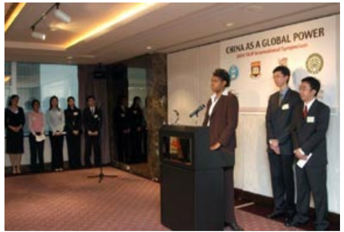
TILIP 2003-04 Closing Ceremony, Hong Kong