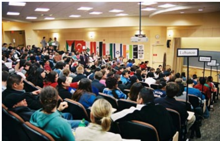
Plenary at the Inquiry Simulation

• Inquiry collaborated with the Tufts Department of Education MAT in social studies program to develop the undergraduates' facilitating skills.