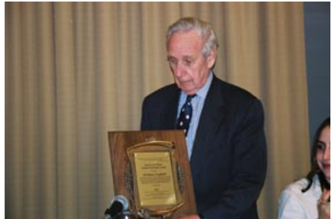
Sir Brian Urquhart